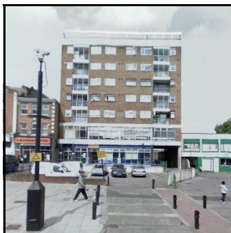
Back 'In house' Clock House, Stamford Hill Neighbourhood Office

For many staff and tenants, 1st April 2011 cannot come fast enough.