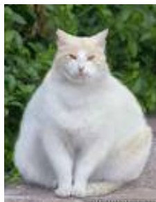
A very fat cat