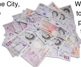
A pile of wasted cash

If you have a consultant doing a manager's job in your department why not suggest that the Council employ a full time permanent member of staff instead, perhaps the authority could even offer the job internally and give some of us the opportunity to develop ourselves!